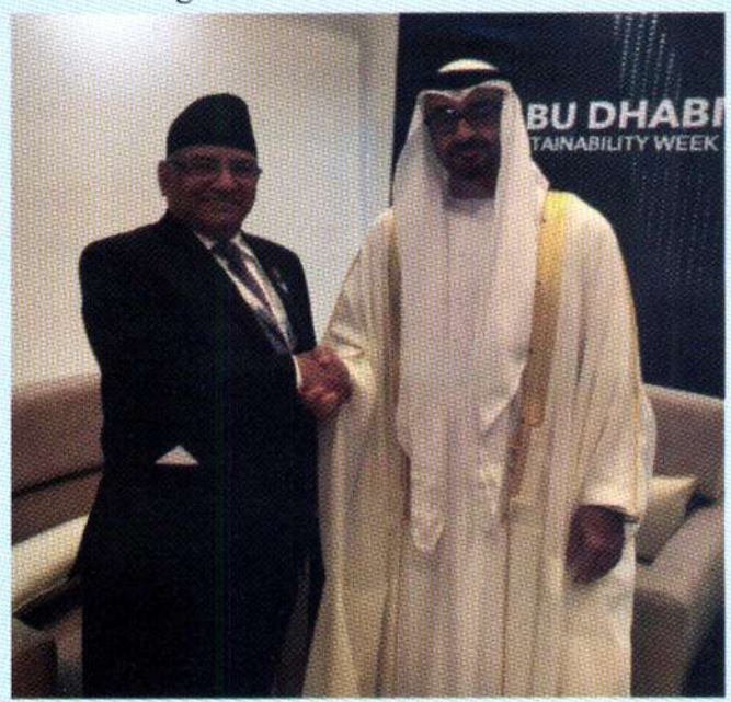
Rt. Hon'ble Prime Minister Pushpa Kamal Dahal 'Prachanda' and His Highness Sheikh Mohamed Bin Zayed Al Nahyan, Crown Prince of Abu Dhabi and Supreme Commander of the UAE Armed Forces

At the invitation of His Highness Sheikh Mohamed Bin Zayed Al Nahyan, Crown Prince of Abu Dhabi and Supreme Commander of the UAE Armed Forces, The Rt. Hon'ble Prime Minister, Pushpa Kamal Dahal 'Prachanda' paid an official visit to the United Arab Emirates (UAE) on 14-17 January 2017. The Rt. Hon'ble Prime Minister addressed the World Future Energy Summit as one of the keynote speakers highlighting the need of sustainable clean renewable energy, leading role of the UAE in development of clean renewable energy as well as the ample opportunities in developing clean renewable energy in Nepal. During the visit, the Rt. Hon'ble Prime Minister also had a bilateral meeting with His Highness Crown Prince of Abu Dhabi.